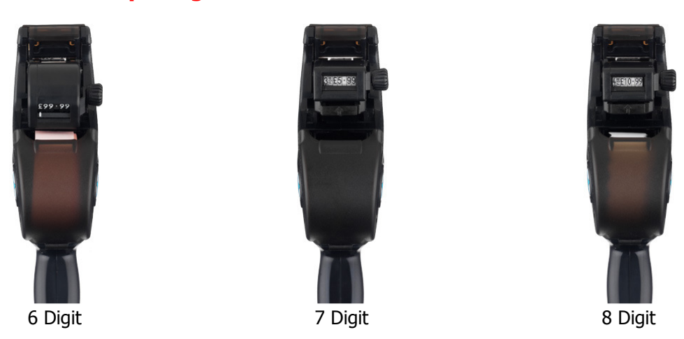
Step 3 – Choose an Interchangeable Block.